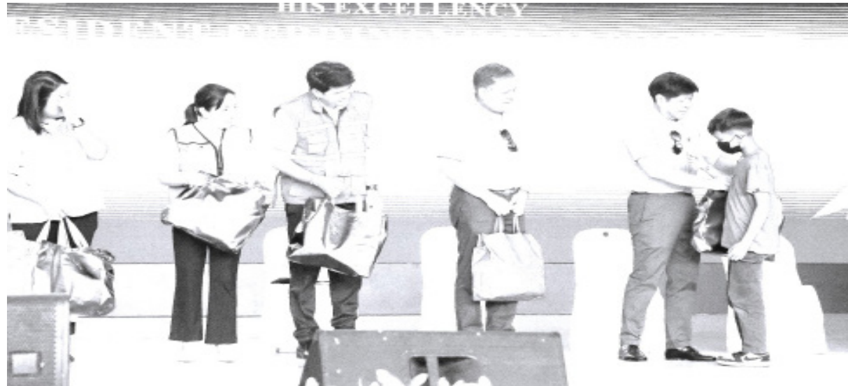
President Ferdinand R. Marcos Jr. leads the distribution of assistance to children, families and Indigenous Peoples in street situations at the Open Amphitheater, Luneta Park in Manila City.

President Ferdinand R. Marcos Jr. graced the grand launch of the Caravan of Special Protection Programs for children, families, and Indigenous Peoples in street situations, on Thursday, December 22, at the Open Amphitheater, Luneta Park.